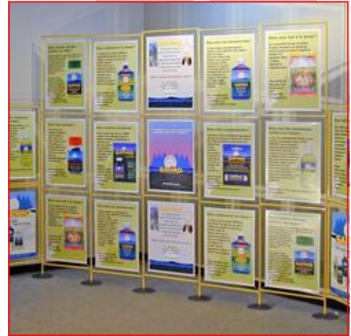
Rods linking up two lengths of frame. This system allows you to take a 2*4m picture wall in a simple 1 m high cardboard tube on your flight.