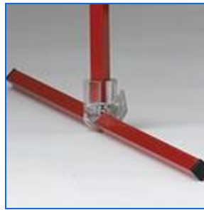
Standard square-profiled stand

Robust profile – anodised aluminium or gloss, 7 colours