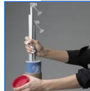
The very easy assembling and dismantling, and the compact way of transportation give