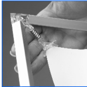
Holding the documents with our transparent plastic clips

To make up a structure, all you need is pre-cut aluminium rods - our designers will have worked on your project beforehand - and single or double 90° angle T fittings. As for accessories, see our very stable steel round bases, plastic caps, strengthening clips for heavier material, or for the display of 2 posters within one frame, etc.